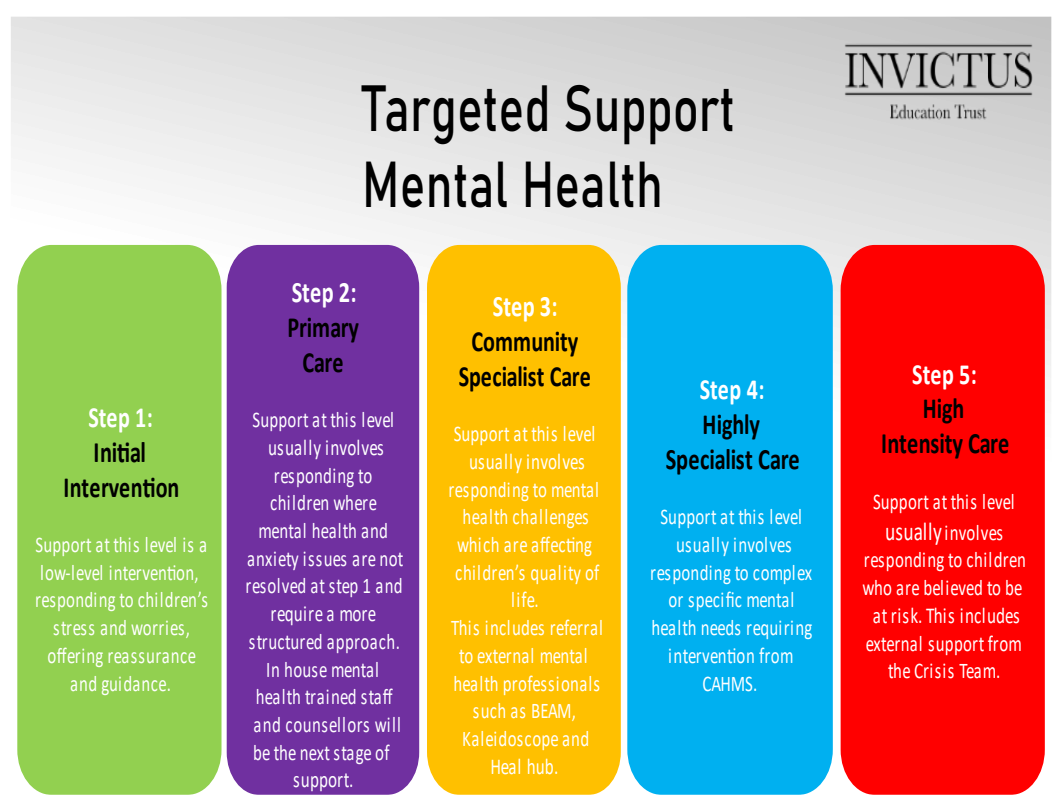
Page 18 of 46